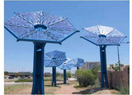
Austin’s largest public art project, the SunFlowers at Mueller use the solar energy they collect during the day to illuminate at night.